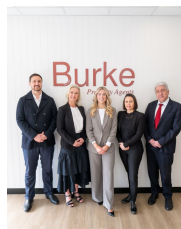
Property Management Team 02 9544 1111

Please register your details to be notified of inspection times by either "book inspection" or "email agent".