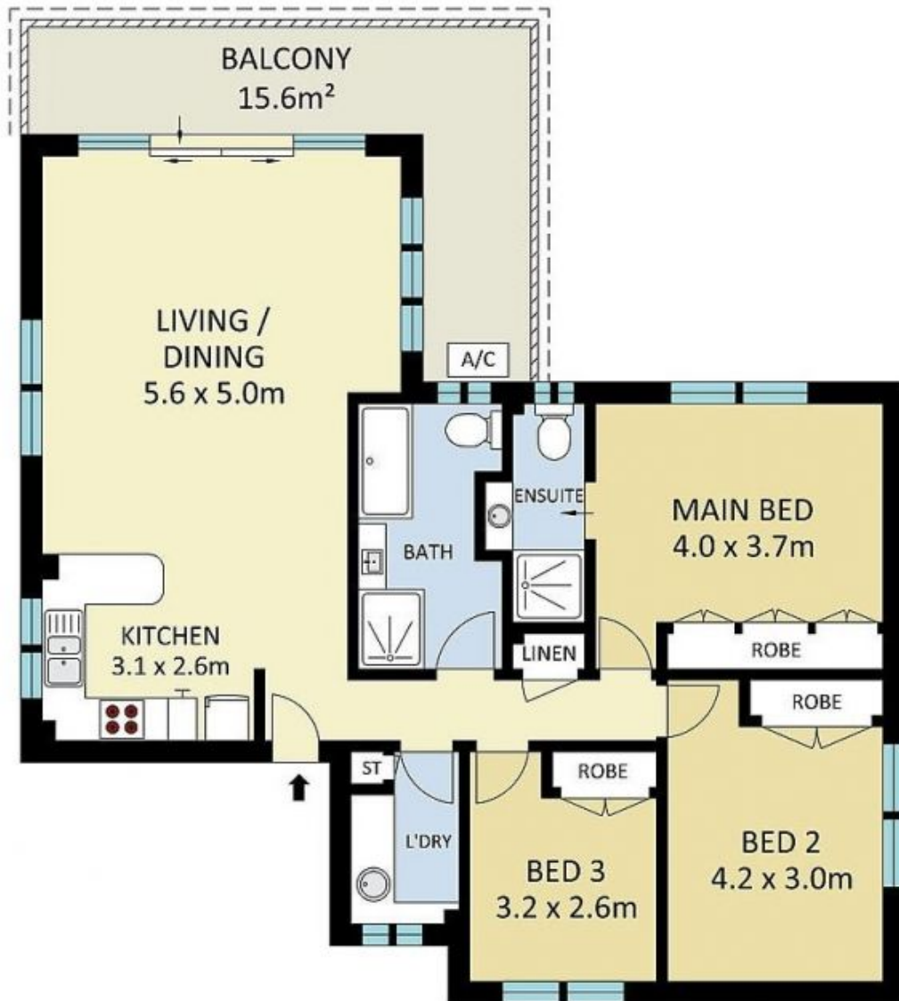
SECOND FLOOR / TOP FLOOR